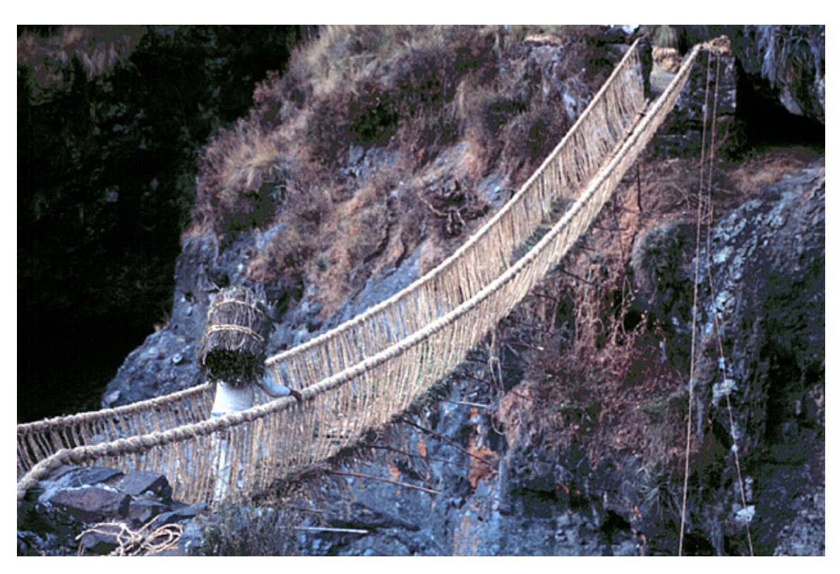
The trimmed mat rolls form the bridge deck.