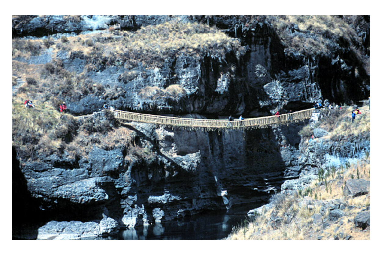
The new bridge is now complete and in use.