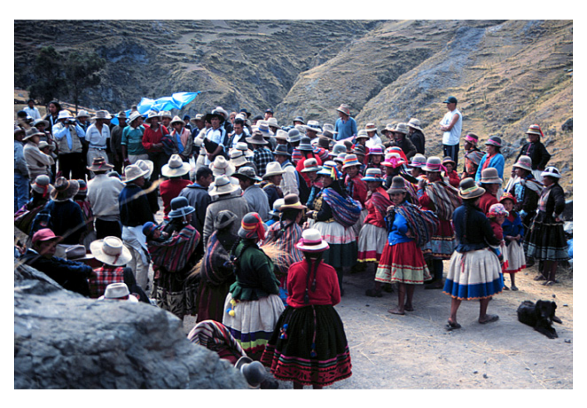
The workers gather to hear instructions.