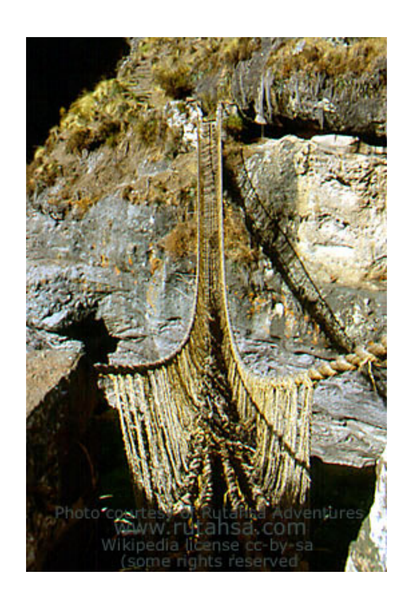
The old bridge is sagging badly.