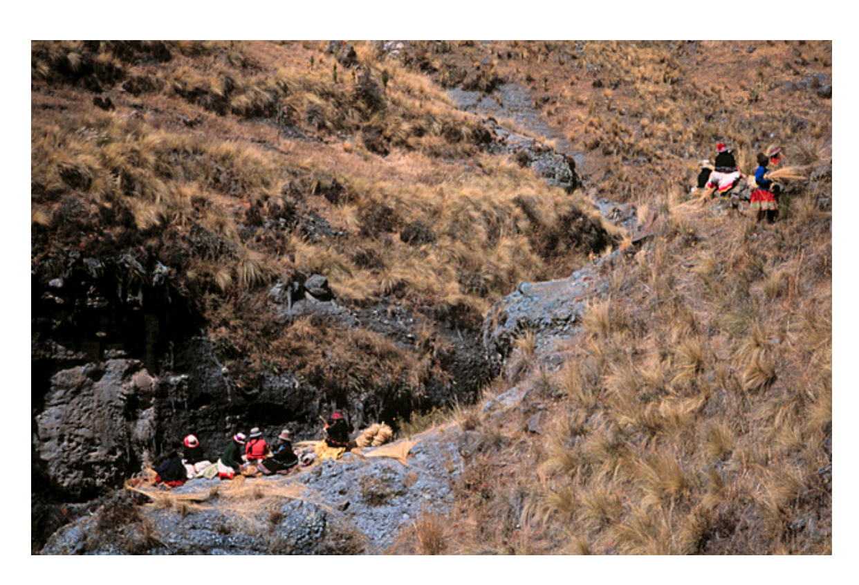
Workers gather ichu grass in the hills and make the lashings.