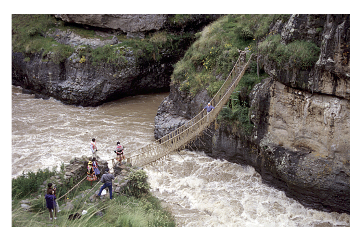
The bridge in use during the rainy season.