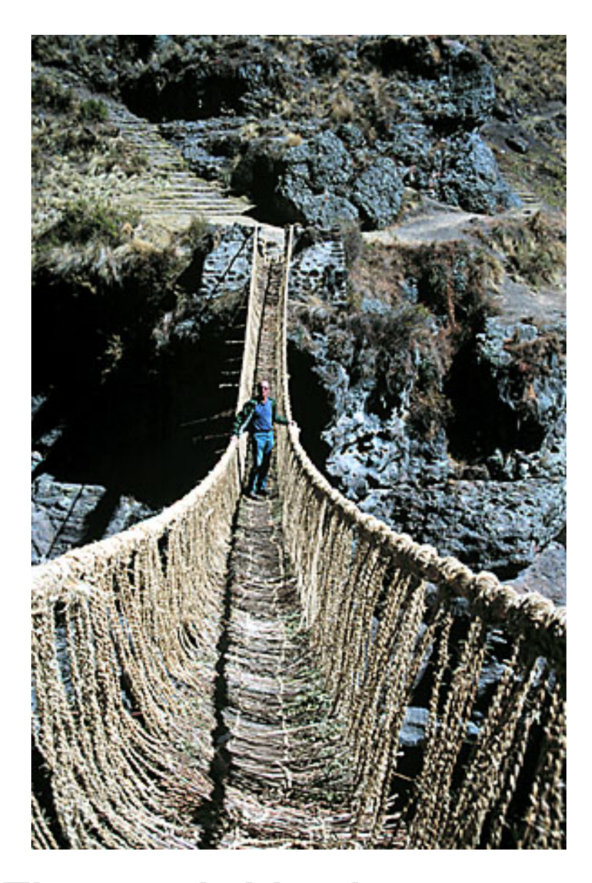
The new bridge is complete and sags much less.