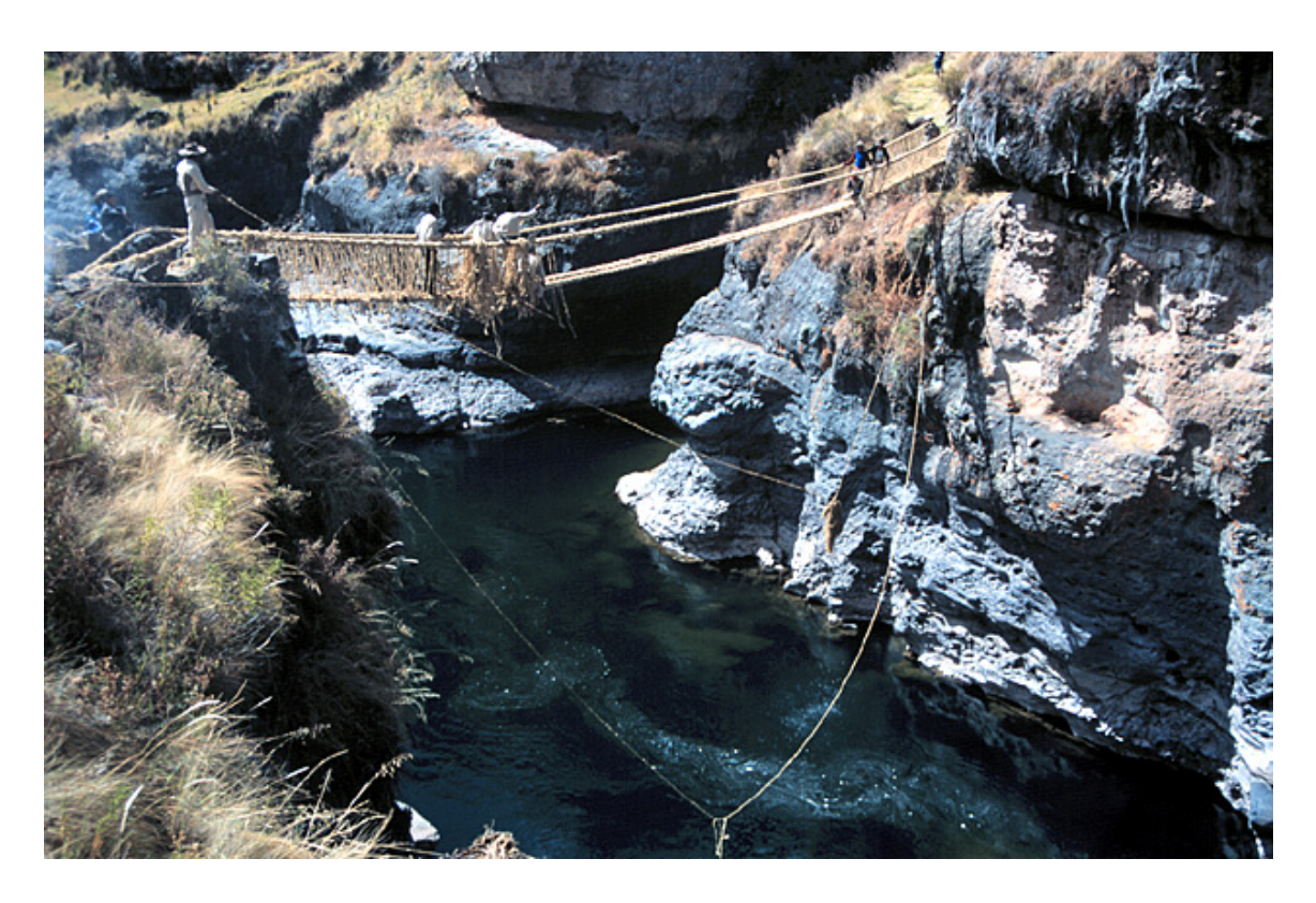
The hand ropes are lashed to the main side cables.